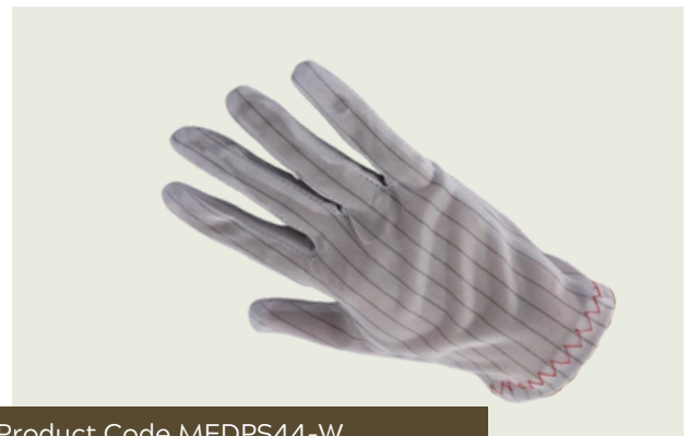
Product Code MEDPS44-W