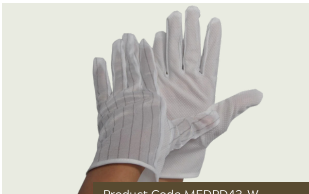
Product Code MEDPD43-W