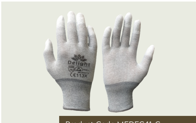
Product Code MEDFC41-G