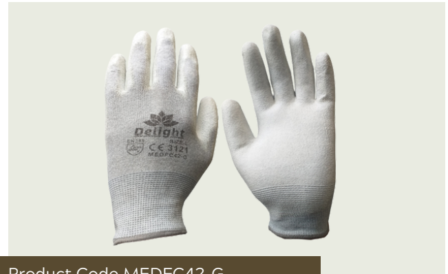
Product Code MEDFC42-G