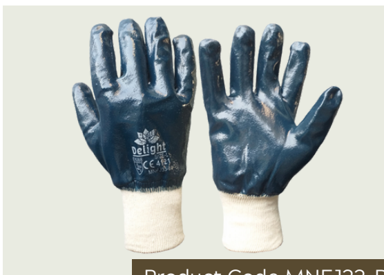
Product Code MNFJ33-B