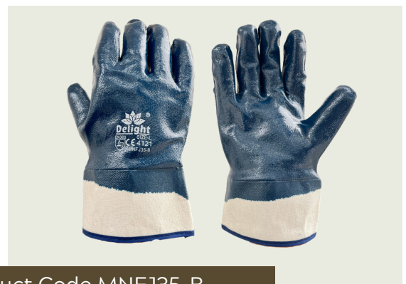
Product Code MNFJ35-B