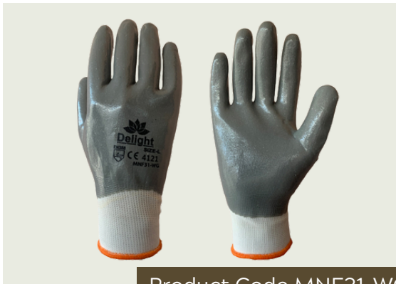
Product Code MNF31-WG