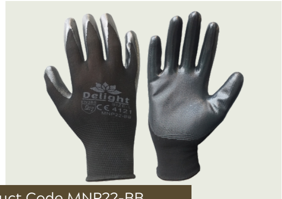
Product Code MNP22-BB