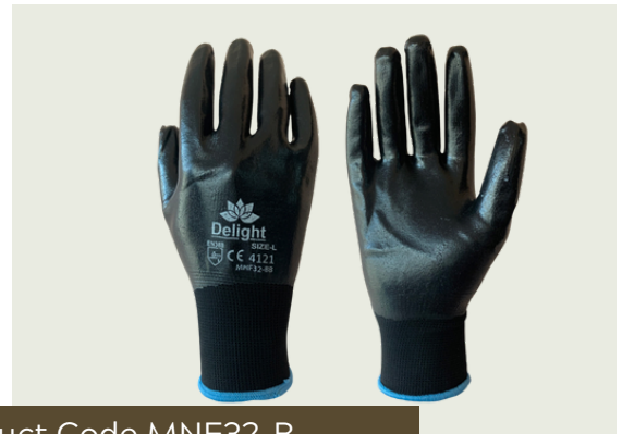
Product Code MNF32-B