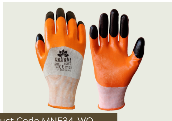
Product Code MNF34-WO