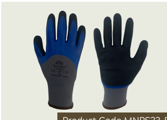
Product Code MNPS23-BB