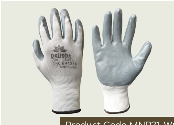
Product Code MNP21-WG